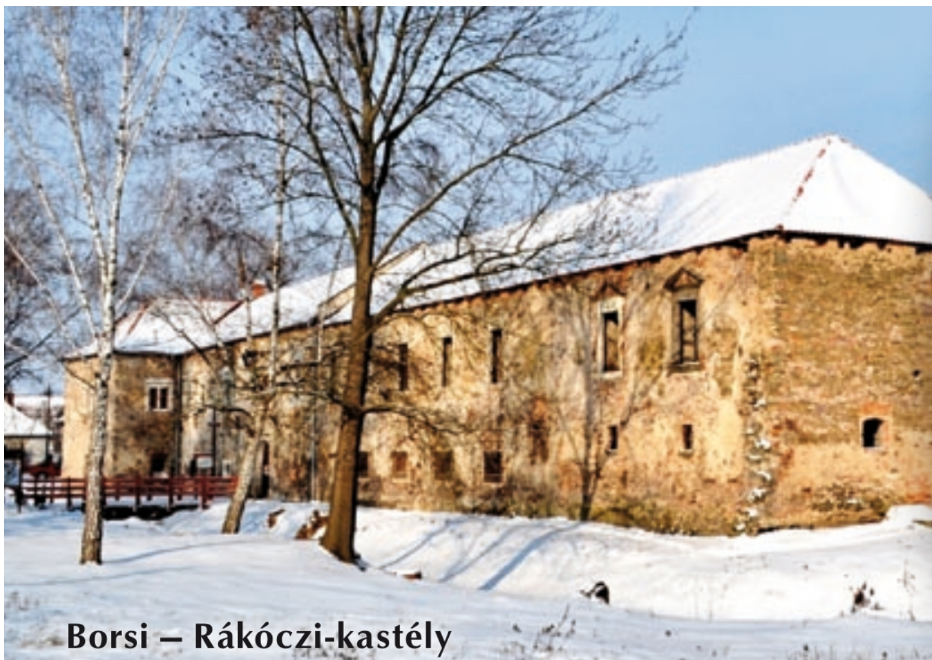
Borsi – Rákóczi-kastély

On April 12 and 13, 2018, our Library will host a conference of Teleki László Foundation entitled Rómer Flóris Plan – Renewing Hungarian Monuments in the Carpathian Basin .